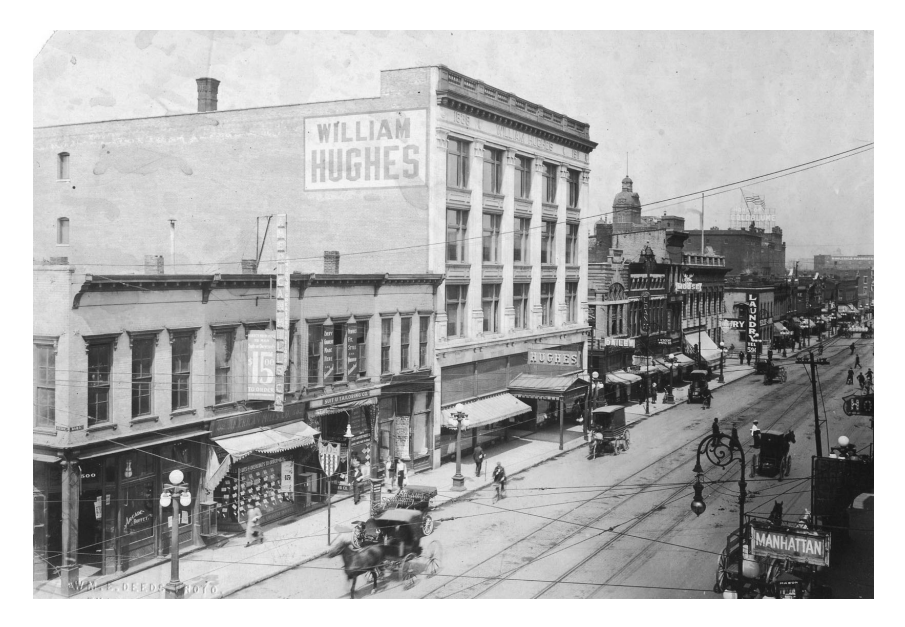
Evansville, ca. 1900. In spite of their city's increasing modernization, many Evansville residents were taken in by the petrified man hoax.

author claimed that he had watched his brother-in-law kill a western Kentuckian who had been stealing property during the Civil War under the guise of being a confederate partisan fighter. When the letter writer first heard about the discovery of the petrified man, he came to Evansville to see the body first-hand. He was convinced that it was the body of the man he had seen killed many years before. The writer expressed some surprise that the body was not discovered until forty years later, and he freely admitted that he did not know how it had come to be found near Evansville, but he was certain the specimen was the right body.<sup>16</sup> Having lived for forty years with the knowledge of having been party to a murder, the anonymous writer suddenly discovered a way to see his guilt "buried decent" along with the petrified man. He was absolutely convinced the stone object was the man he had seen killed, no matter how much he had to strain fact and belief to do so. In much the same way, the woman who claimed the stone image as her "lost"